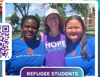
REFUGEE STUDENTS ON CAMPUS