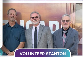
VOLUNTEER STANTON MOBILE DRIVERS