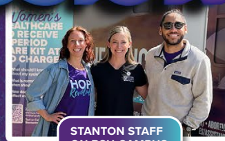
STANTON STAFF ON BSU CAMPUS