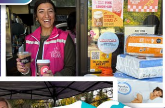
HUMAN BEAN DIAPER DRIVE